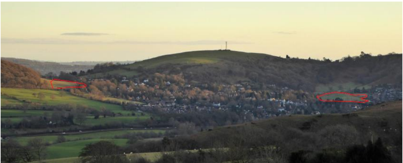
View from Plush Hill showing Snatchfields (R) and Gaerstone (L) sites, both of high visibility.

The Snatchfields site is lower than Gaerstone and more integrated with the town, but is nevertheless of high visual sensitivity as the land provides a valuable section of green open space within the development boundary, and linking strongly to the hillside above. The site also has ancient field patterns, and will be difficult to access for housing.