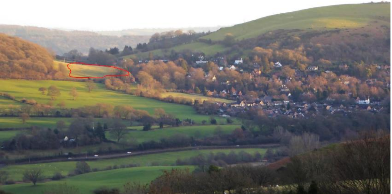
View from Plush Hill on the Long Mynd (a very popular visitor location) showing the Gaerstone site (CST020) with very high visibility on the ridgetop location (skyline from slightly lower angles).