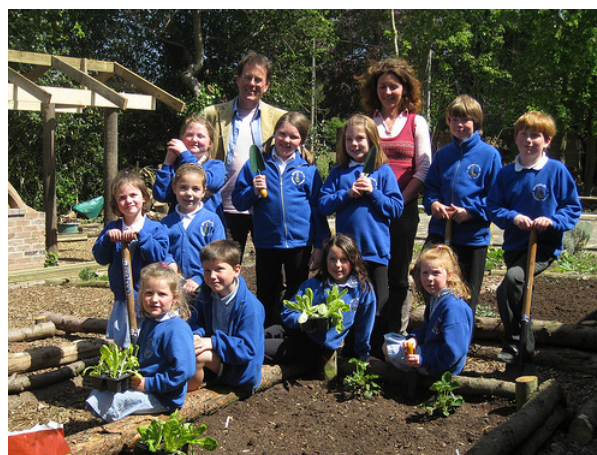
Bitterley School Outdoor Classroom project supported by SDF.

The projects varied from helping Hopton Castle Preservation Trust purchase the castle and grounds and begin stabilisation and repair work, supporting the development of two log eco-cabins at Lower Bush Farm and raising awareness of the importance of the Atlantic Salmon through farm visits, events and targeting schools with 'Salmon in the Classroom' activities.