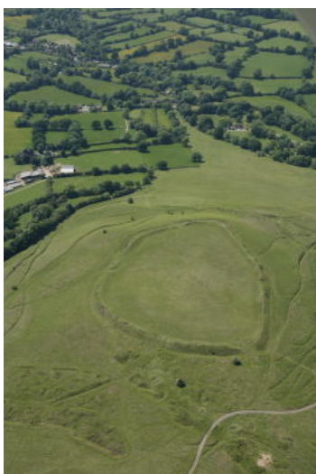
Nordy Bank hillfort on the slopes of Brown Clee

As the funding is reduced we are always looking for other sources of income to enhance the grant scheme and your membership to Friends of the Shropshire Hills is an important and valuable way of supporting new and innovative projects, so thank you very much. Further details of all the Sustainable Development Fund projects, past and present, are available on the website at http://www.shropshirehillsaonb.co.uk/partnership/sdfund.htm#reports