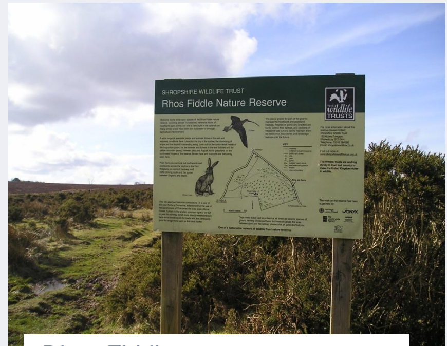
•Rhos Fiddle nature reserve